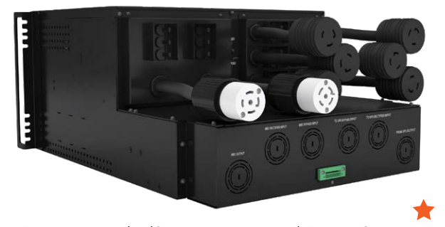
Rear view with I/O connections and Power Output Distribution options (hardwire and/or PODs)