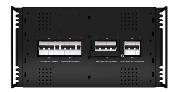
Front view (panel off) offers easy access to breakers

Utilize the optimized maintenance bypass option to enhance availability and keep your critical systems running during routine service or replacement. A maintenance bypass interlock ensures proper bypass operation.