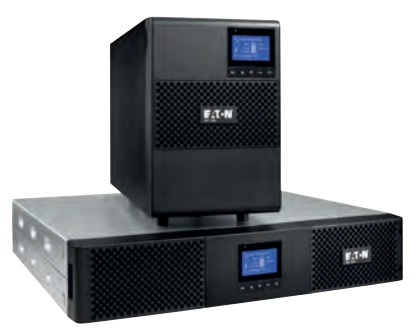
9SX Rack & Tower models