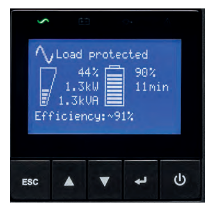
9SX graphical LCD