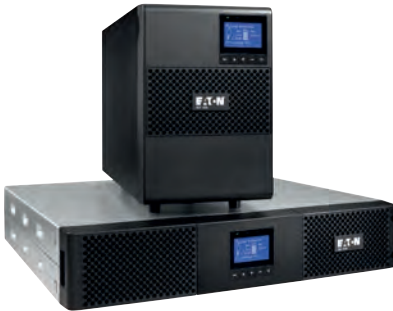
9SX Rack & Tower models